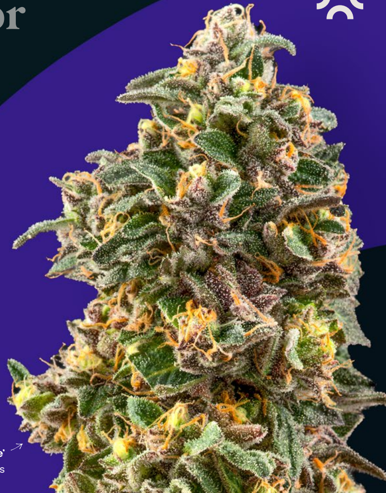
'Jet Fuel Pie' → 4C LABS Craft Cannabis